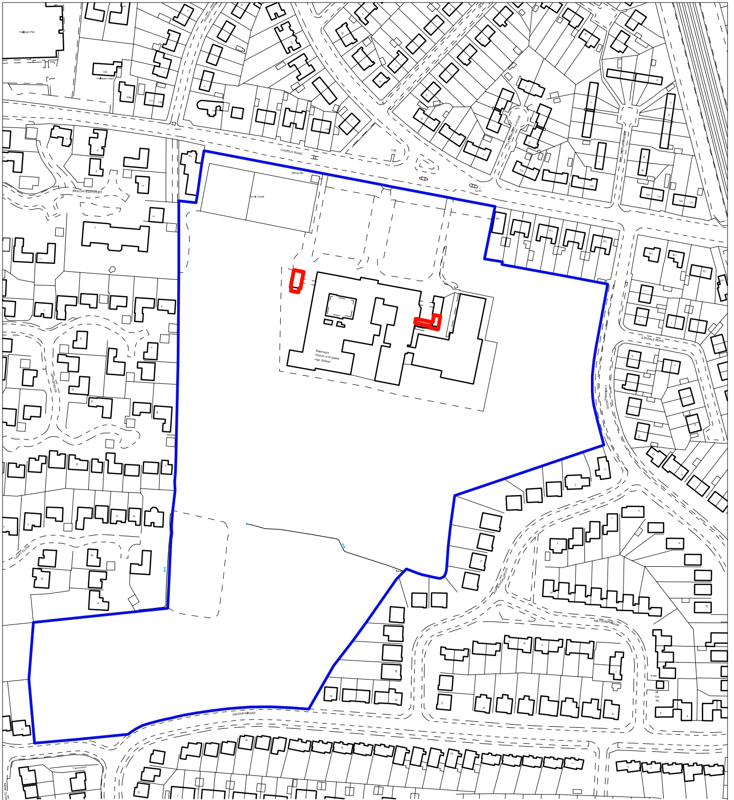
Site location plan Scale 1:2500 @ A4