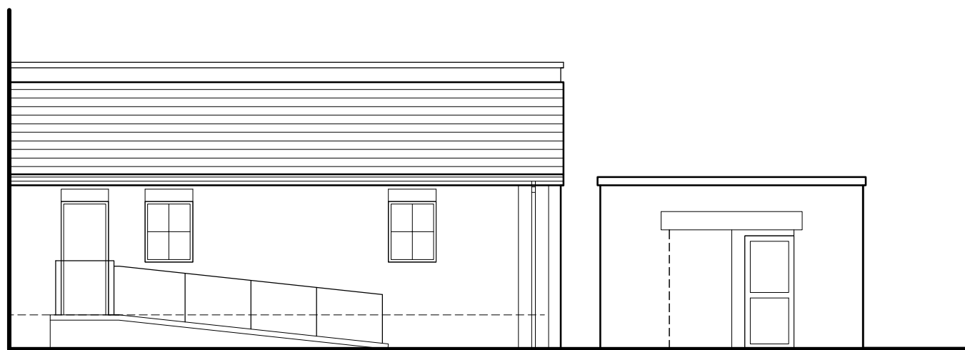
Elevation as existing (S)